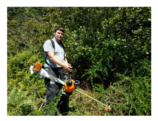
A CCC crew member manages invasive plants for Friends of Sears Island (Protective equipment removed for photograph).

See the Calendar on our website for dates and information on our ecological land management workshops.