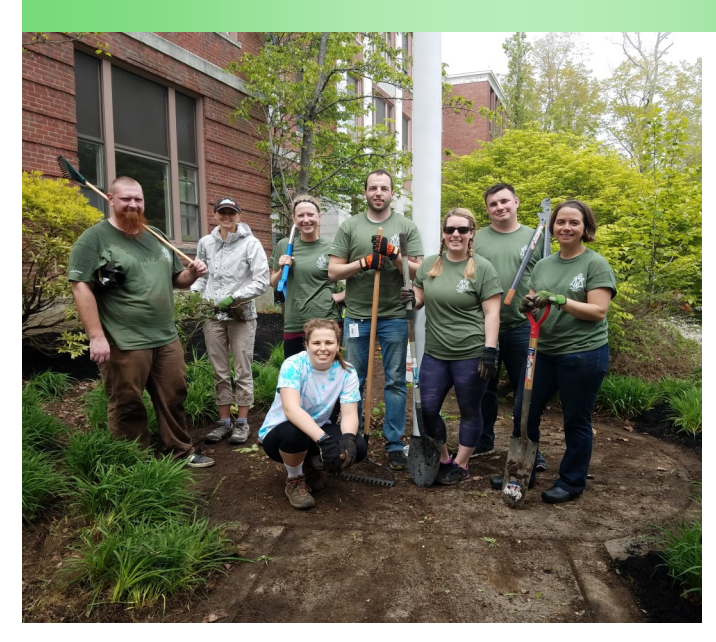
Community Conservation Corps interns lead Athena Health volunteers (in green shirts) in the Crosby Center green space revitalization.